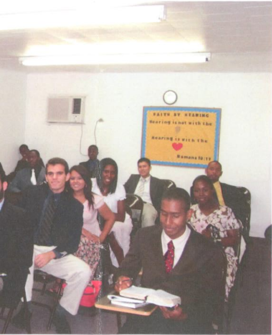
Senior SS class