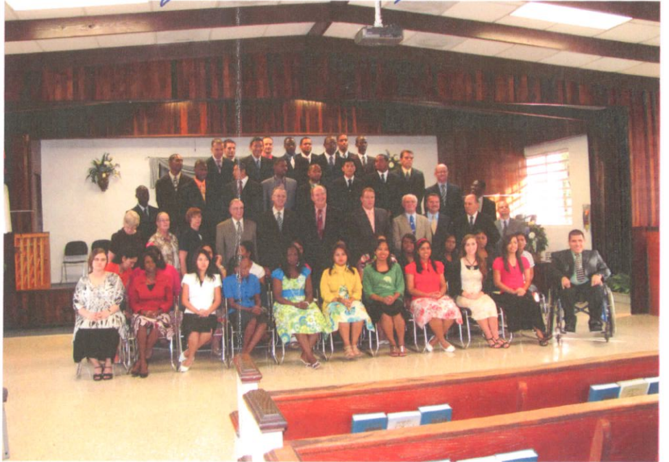
2011-2012 Staff & Students