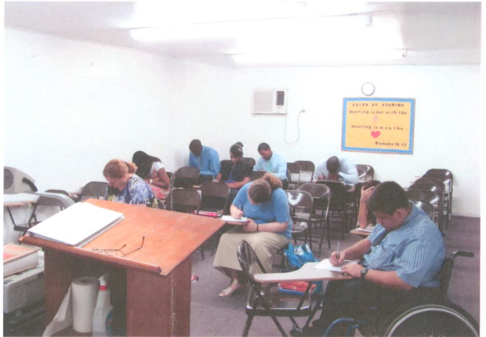
Baptist Polity Class