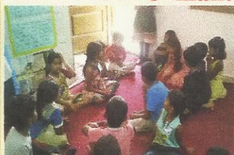
Bible Hour at White Field Baptist Church