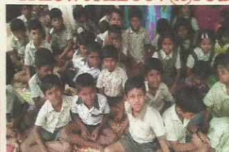
Grace Baptist School for the Hearing and Hearing Impaired