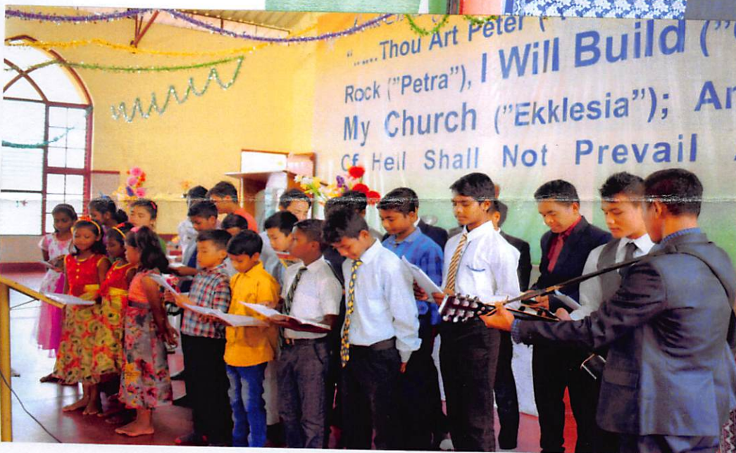
SHALOM BAPTIST SCHOOLS JUVENILES