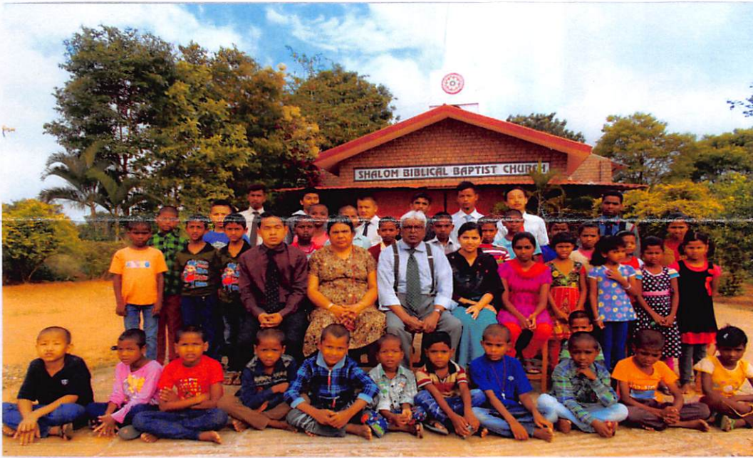
SHALOM BAPTIST ORPHANAGE CHILDREN