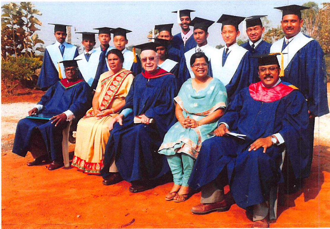
SHALOMS 27 TH GRADUATION EXERCISE