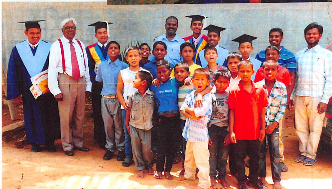
ORPHANAGE KID'S REJOICE WITH GRADUATES ON 18 TH MARCH 2016