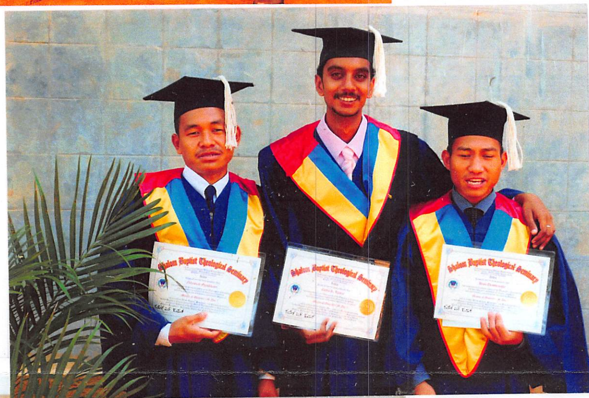
M. DIV. DEGREE HOLDERS