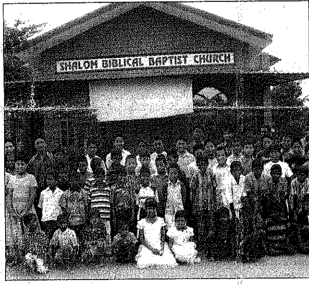
ALL IN THE FAMILY: The Shalom Baptist Orphanage offers children food, education and clothes, apart from love and care

started in Mysore on October 21, 1988, is now functioning in Bangalore, where 68 children, including 12 girls, are sheltered.