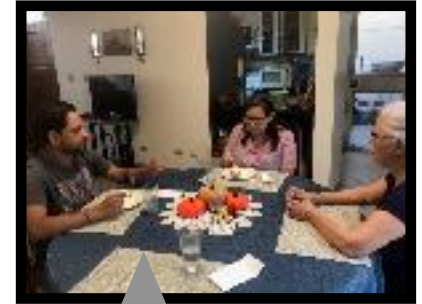
Our Spanish teacher and her son came for an afternoon. It was the first time this year!