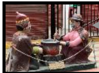
"Mask- Up" must be mandatory for them too! Jajaja!

(They were my Bible students for five years!)