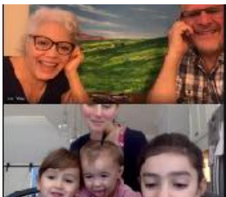
Bible Time with 3 of our Grands!

Reaching the world and Teaching the Word For Christ!