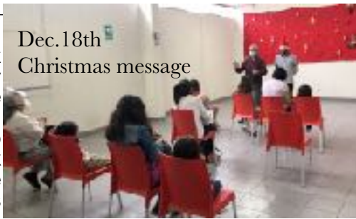
Dec.18th Christmas message