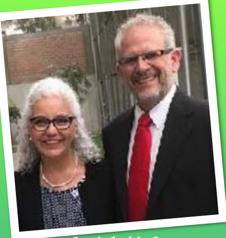
Isaiah 44: 8

“Fear ye not, neither be afraid: have not I told thee from that time, and have declared it? ye are even my witnesses. Is there a God beside me? yea, there is no God; I know not any.”