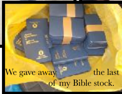
We gave away the last of my Bible stock.

More to be desired are they than gold, yea, than much fine gold: sweeter also than honey and the honeycomb.