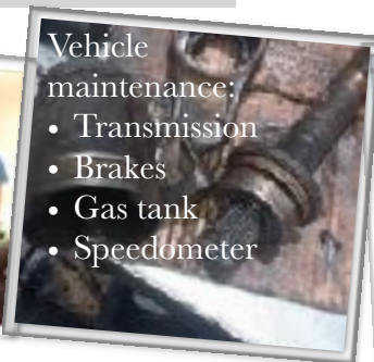
Vehicle maintenance: • Transmission • Brakes • Gas tank • Speedometer