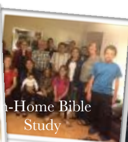
Home Bible Study