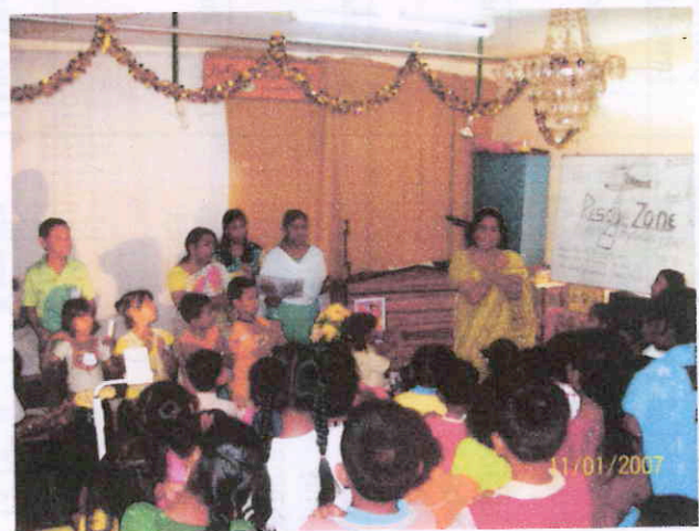
AT WHITEFIELD BAPTIST CHURCH