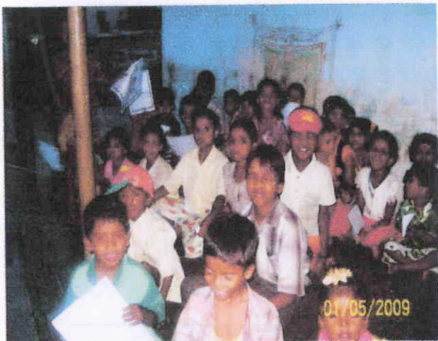
V.B.S AT KAGGADASAPURA