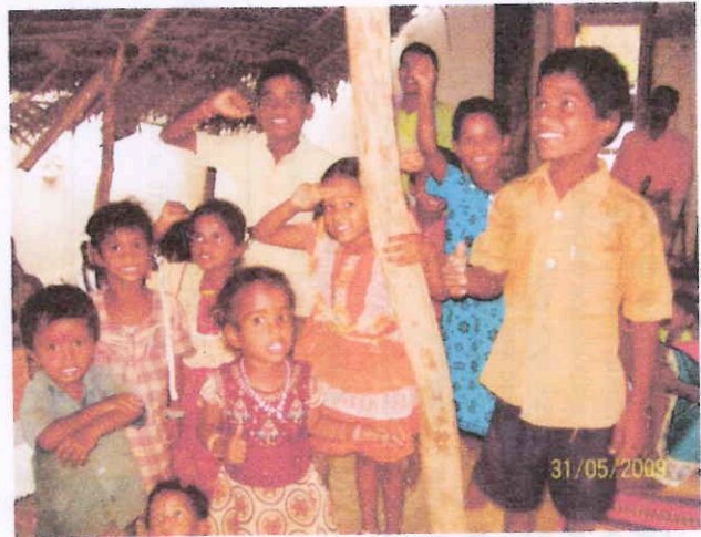
AT KURUMBERI BAPTIST CHURCH