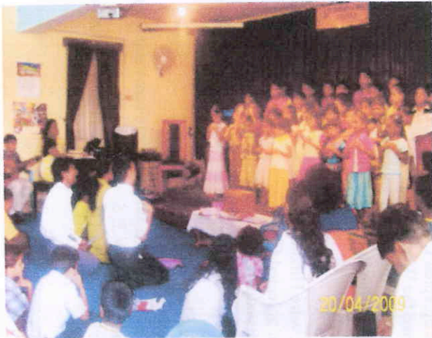
AT OLIVET-GRACE BAPTIST CHURCH