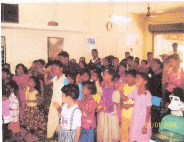
AT TIRUPATTUR BAPTIST CHURCH