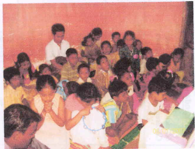
V.B.S AT PUDURNADU (JAWADHI MTS.)